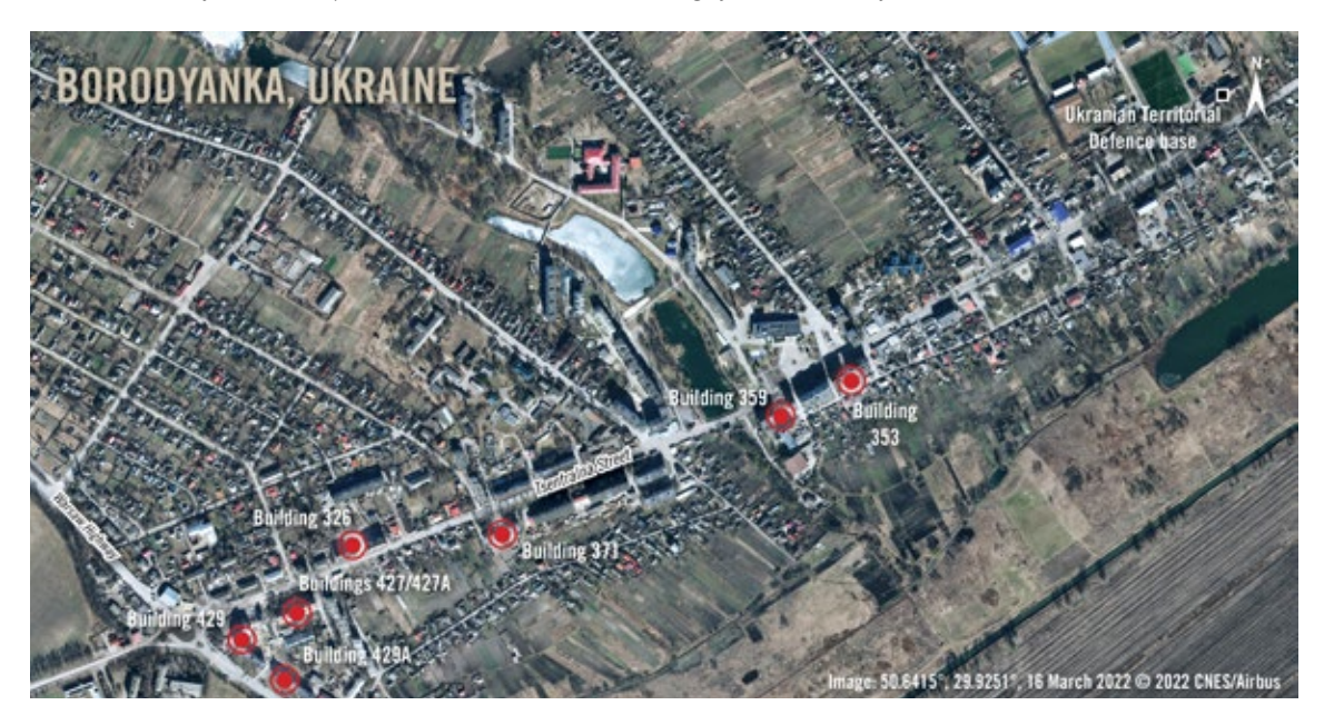
Satellite imagery from 16 March 2022, shows the Borodyanka area where airstrikes to buildings were documented. The buildings are highlighted on the map.