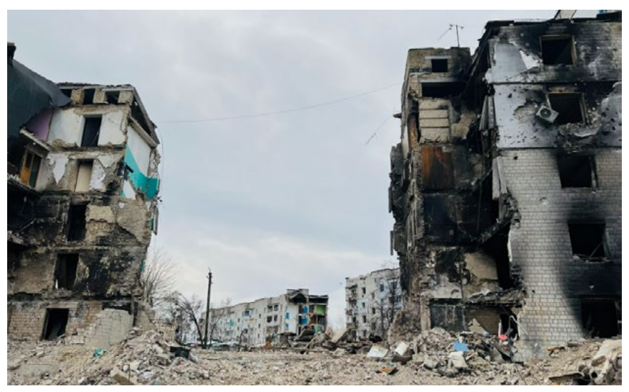
⊚↑ Buildings 429 and 429A which were bombed on the 1st of March 2022 in Borodyanka.