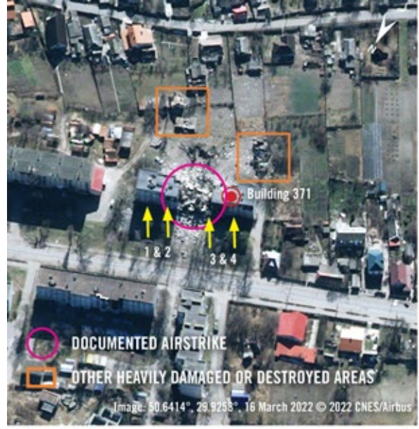
Satellite imagery from 14 October 2019, shows building 371. The relevant entrances to the building have been marked. On 16 March 2022, satellite imagery shows destruction from a documented airstrike and other heavily damaged areas nearby. No large military objects were readily visible in imagery from 27 February 2022 (not shown).

metres down the street from the first buildings that were hit. Among those killed in that attack were Vitaliy Smishchuk, a 39-year-old surgeon, his wife Tatiana, in her mid-thirties, and their four-year-old daughter Yeva. Vitaliy's mother recalled: