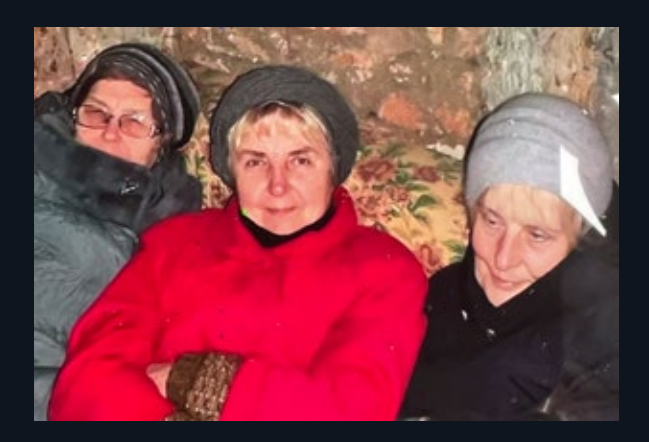
(R), Building 359